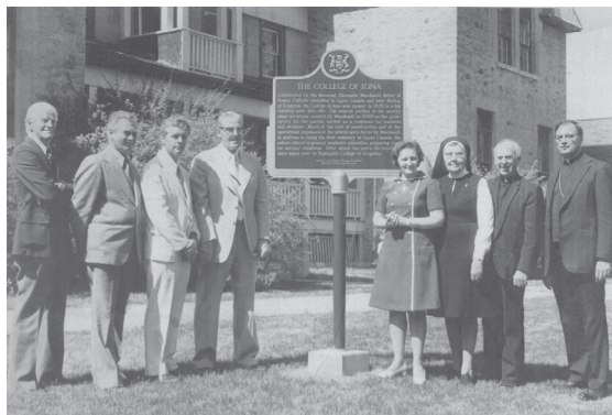
1975 College of Iona Provincial Plaque unveiling

Immediate priorities are the roof, windows, and installation of an air exchanger system. Having reached their $100,000 goal, including a $20,000 grant from the McLean Foundation, they now qualify for a Parks Canada matching cost sharing program.